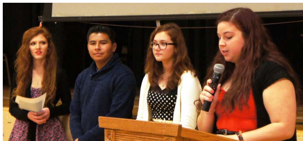
Hebrew High students and student from Greencastle-Antrim School District introducing Kristallnacht program