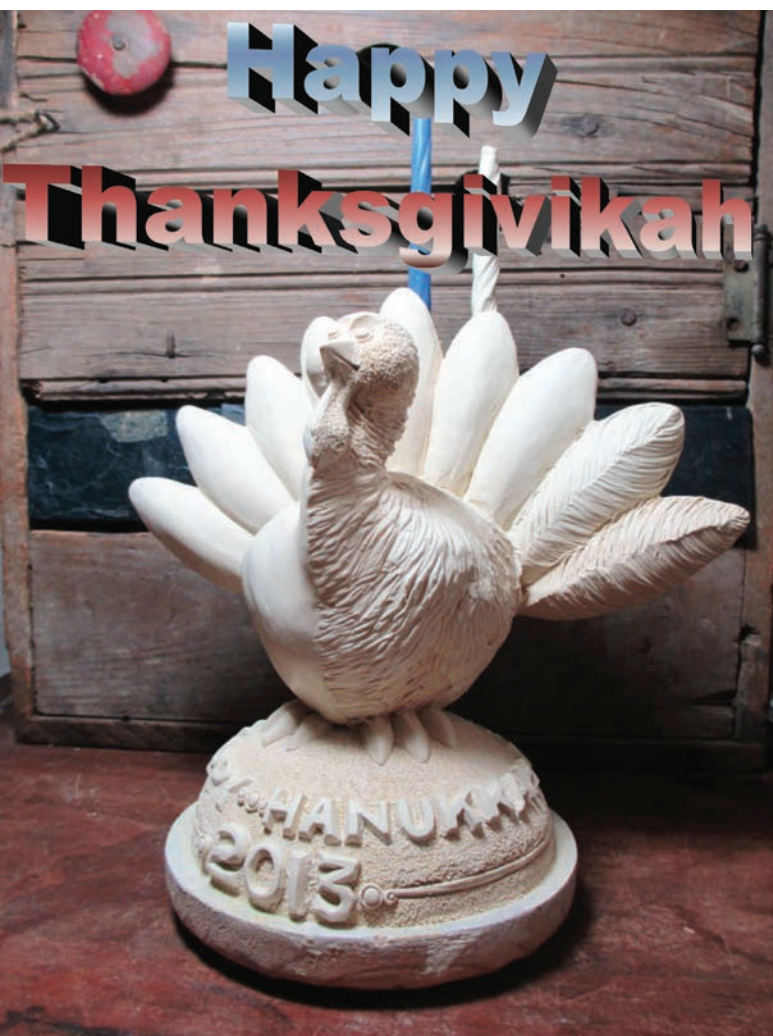
From the Board and Staff of the Jewish Federation of Greater Harrisburg