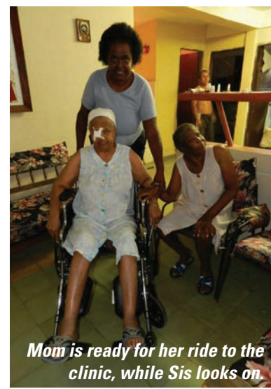
Mom is ready for her ride to the clinic, while Sis looks on.