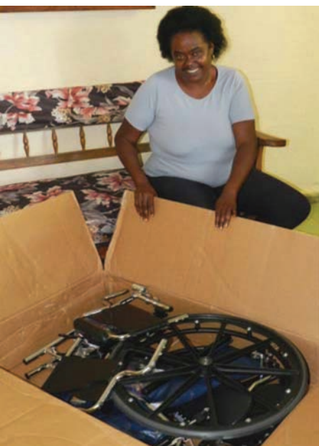
A Jewish Home wheelchair reaches its destination and its happy recipient, in Cuba.

are potholed, and the government-issued wheelchair broke. Because the woman works, she does not qualify for any aid - or a new wheelchair.